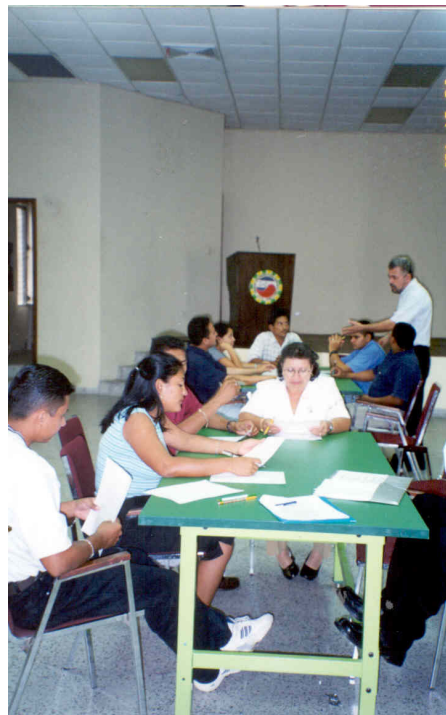
Photo: Professional development workshop