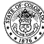
Barbara O'Brien Lt. Governor

OFFICE OF THE LIEUTENANT GOVERNOR 130 State Capitol Denver, Colorado 80203-1792 Phone: (303) 866-2087